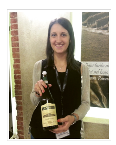
Boffa of Fratelli Serio & Battista Borgogno one of three wineries I gave high ratings to on both Barolo Classico 2011 and Barolo Riserva 2009