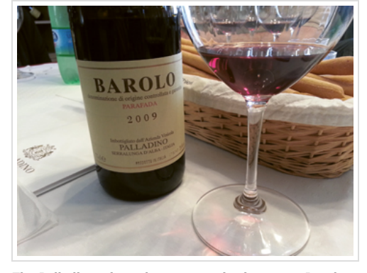
The Palladino winery has two entries in my top Barolo 2011 selection including this Parafada single vineyard; the 2009 I tasted was also excellent

Barolo 2011 vintage - out of 268 wines tasted from this 2011 release, I feel that this is a real winning vintage for Barolo. Across the different Barolo communes, the wines tasted very consistent with excellent fruit concentration and acid backbone. The Barolo 2011 wines I tasted are already delicious to drink, but they possess huge potential to age and further improve. I gave good scores to 41 percent of the wines. Based on the different Barolo communes (which were correctly segregated by the organizer) I tasted, I thoroughly enjoyed almost every single bottle from the smaller Novello commune. Wines from Sarralunga d'Alba and Barolo communes also got better average marks from me than those from La Morra and Castiglione Falletto on this vintage. My mammoth list (first 60 out of 108) of highly