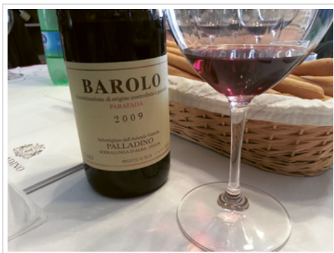
The Palladino winery has two entries in my top Barolo 2011 selection including this Parafada single vineyard; the 2009 I tasted was also excellent

Barolo 2011 vintage – out of 268 wines tasted from this 2011 release, I feel that this is a real winning vintage for Barolo. Across the different Barolo communes, the wines tasted very consistent with excellent fruit concentration and acid backbone. The Barolo 2011 wines I tasted are already delicious to drink, but they possess huge potential to age and further improve. I gave good scores to 41 percent of the wines. Based on the different Barolo communes (which were correctly segregated by the organizer) I tasted, I thoroughly enjoyed almost every single bottle from the smaller Novello commune. Wines from Serralunga d’Alba and Barolo communes also got better average marks from me than those from La Morra and Castiglione Falletto on this vintage. My mammoth list (first 60 out of 108) of highly